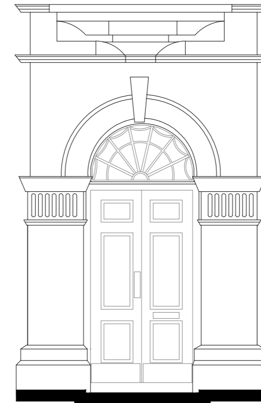
02 EXISTING ELEVATION 2 1:50